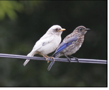
White bluebird or blue whitebird? Leucistic WEBL and sibling.